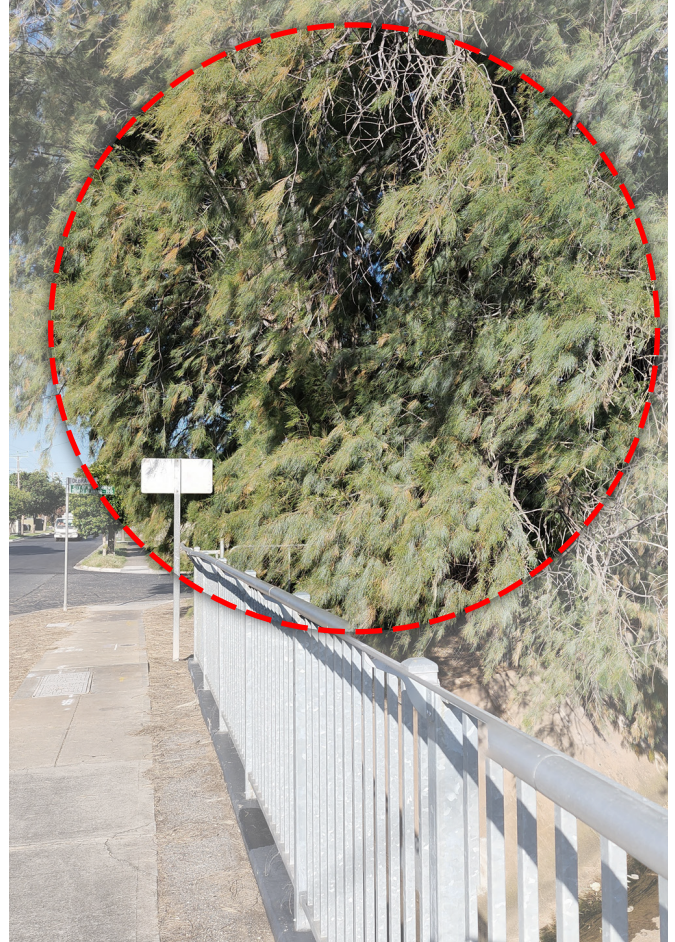
Athel Pines to be removed to establish site compound

These works are being managed on behalf of the Brown Hill and Keswick Creeks Stormwater Board.