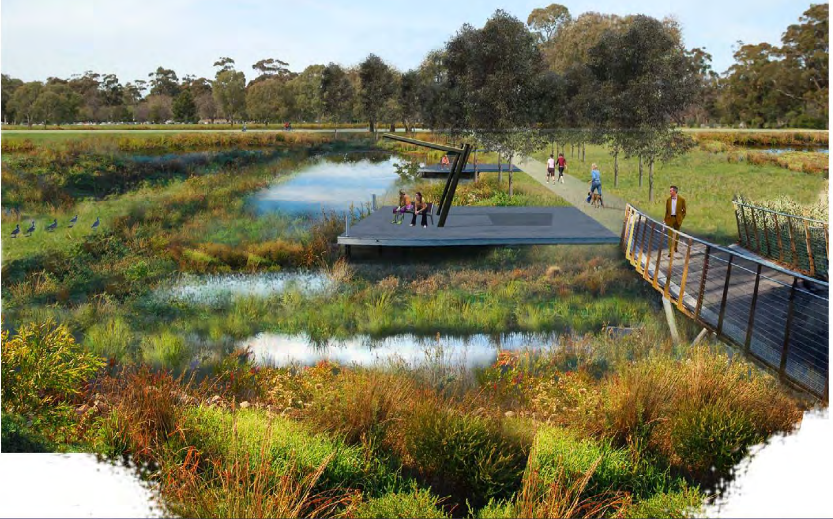
Brown Hill and Keswick Creek Stormwater Project VICTORIA PARK FUTURE PERSPECTIVE